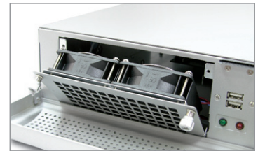
Front Replaceable Air Filters/Fans

Convenient to change air filters or fans when needed